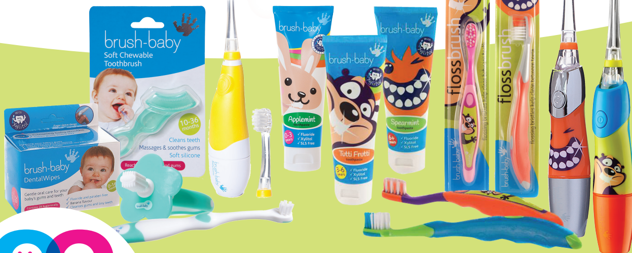
DentalWipes, FirstBrush, BabySonic, Chewable Toothbrush, KidsSonic, FlossBrush, Xylitol toothpastes